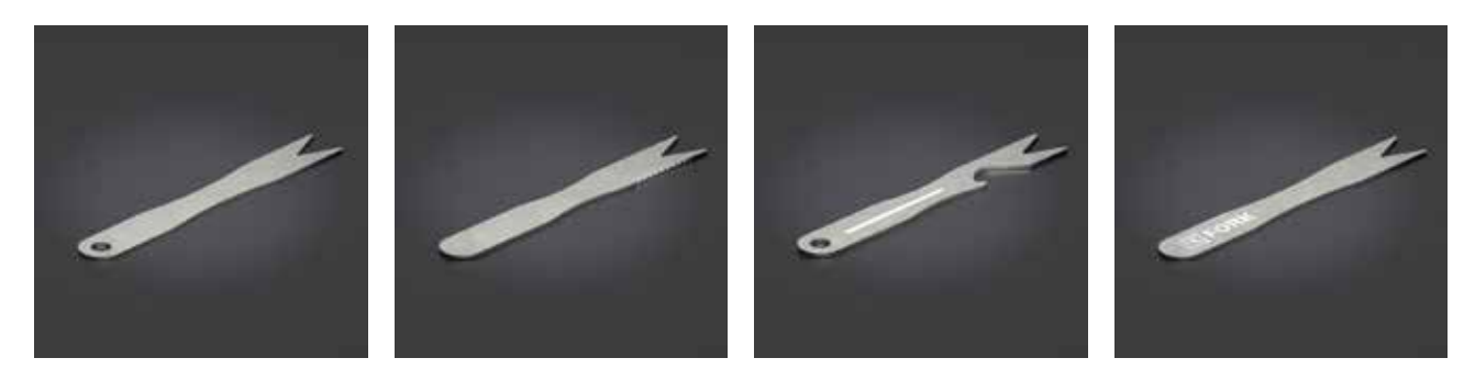
Variantenreich (v.l.n.r.): die, Classic' mit Lochung / die, Saw' / die, Opener' mit Lochung und Prägung / die, Classic' mit Laser-Garvur