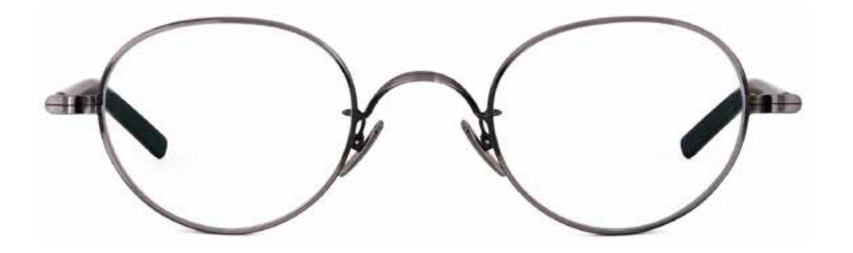
Classic shape with modern elements for stylish appearance: Lunor M6