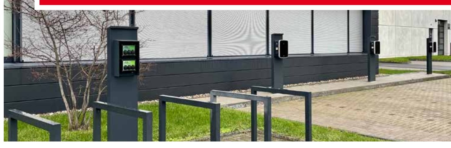
Charging stations for electric mobility. EK focuses on sustainable solutions in its offering.

A particularly important factor for the growth of electromobility in 2022 was the introduction of the GHG quota in Germany. The greenhouse gas reduction quota rewards e-car drivers and charging infrastructure