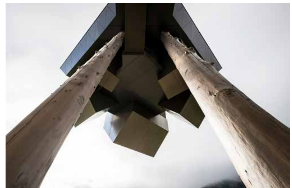
Modern architecture: harmonious materiality, straight lines, combined with perfect functionality.

Who would like to treat itself to a time-out at this special place and enjoy Wellness in "Heaven & Hell", finds out more under www.hotel-hubertus.com as well as by E-Mail to info@hotel-hubertus.com and by telephone under +39 0474 59 21 04.