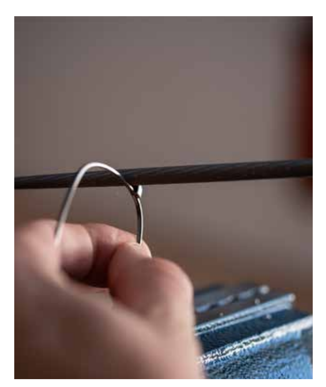
In the production of Lunor models, real handwork is still required - and desired.