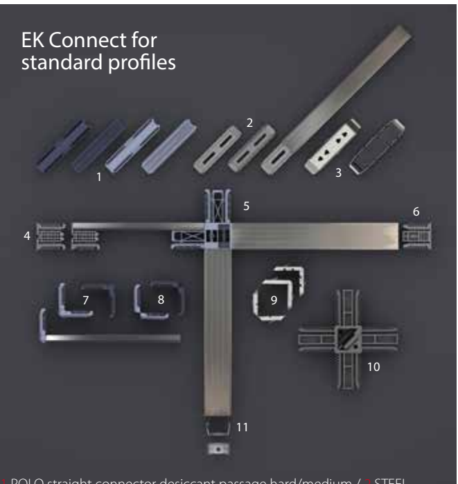
POLO straight connector desiccant passage hard/medium / STEEL straight connector desiccant passage / STEEL straight connector desiccant stop with/without sealing insert / POLO Georgian bar end piece Duplex and Twin-profile / POLO Georgian bar cross connector Duplex and Twin-profile / POLO Georgian bar end piece Duplex-profile NXT / POLO corner sey medium/hard / POLO model corner key medium/hard / STEEL corner and model corner key / POLO Georgian bar cross connector Duplex-profile NXT / STEEL Georgian bar spring clamp Duplex-profile